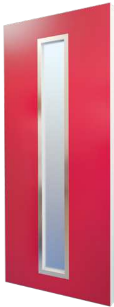
Westonbirt Leaf CWD014

Designer panels are available in Smarts Sensations, Cotswold, Naturals and also RAL colour ranges.