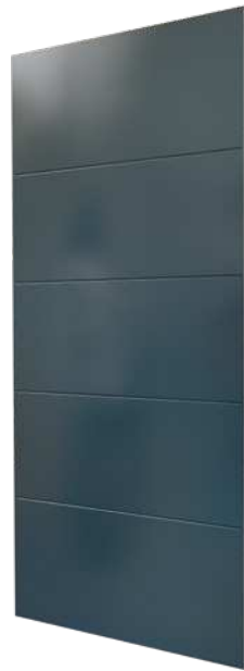
Textured Anthracite KL14ST Anthracite Grey KL005