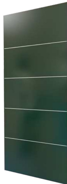
Amazon Green SEN011