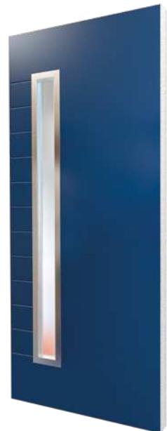
Ocean Blue SEN007